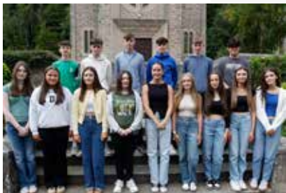
Top achievers at GCSE.

Our prestigious Annual Prize Giving celebrates those who inspire others to follow in their footsteps by achieving impressive academic standards, testimony to our diligent pupils and dedicated staff.