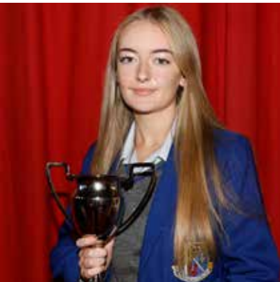
10 A*s at GCSE.

From the moment a child steps through our doors in Year 8, they join a community that champions excellence, applauds effort, and celebrates character. We believe that even the smallest acts, carried out with great love, deserve recognition.