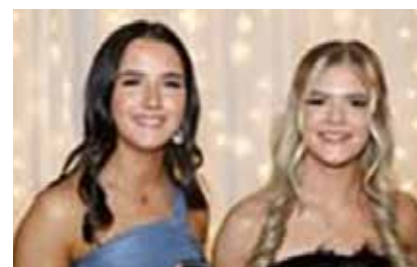
2025 Camogie Allstars.