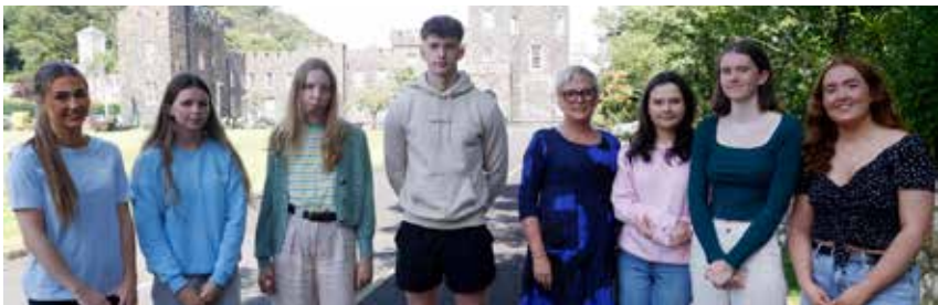
Straight A's at A-Level.

At St Killian's, every achievement tells a story of ambition, resilience, and pride—because when our pupils succeed, we succeed too.