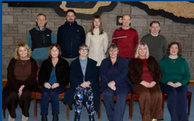
Office Staff and Technicians.