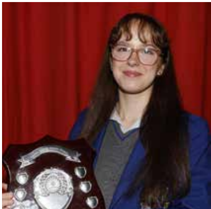
7 A*s & 3 A's at GCSE, AABB at AS-Level.