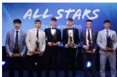
2025 Hurling Allstars.